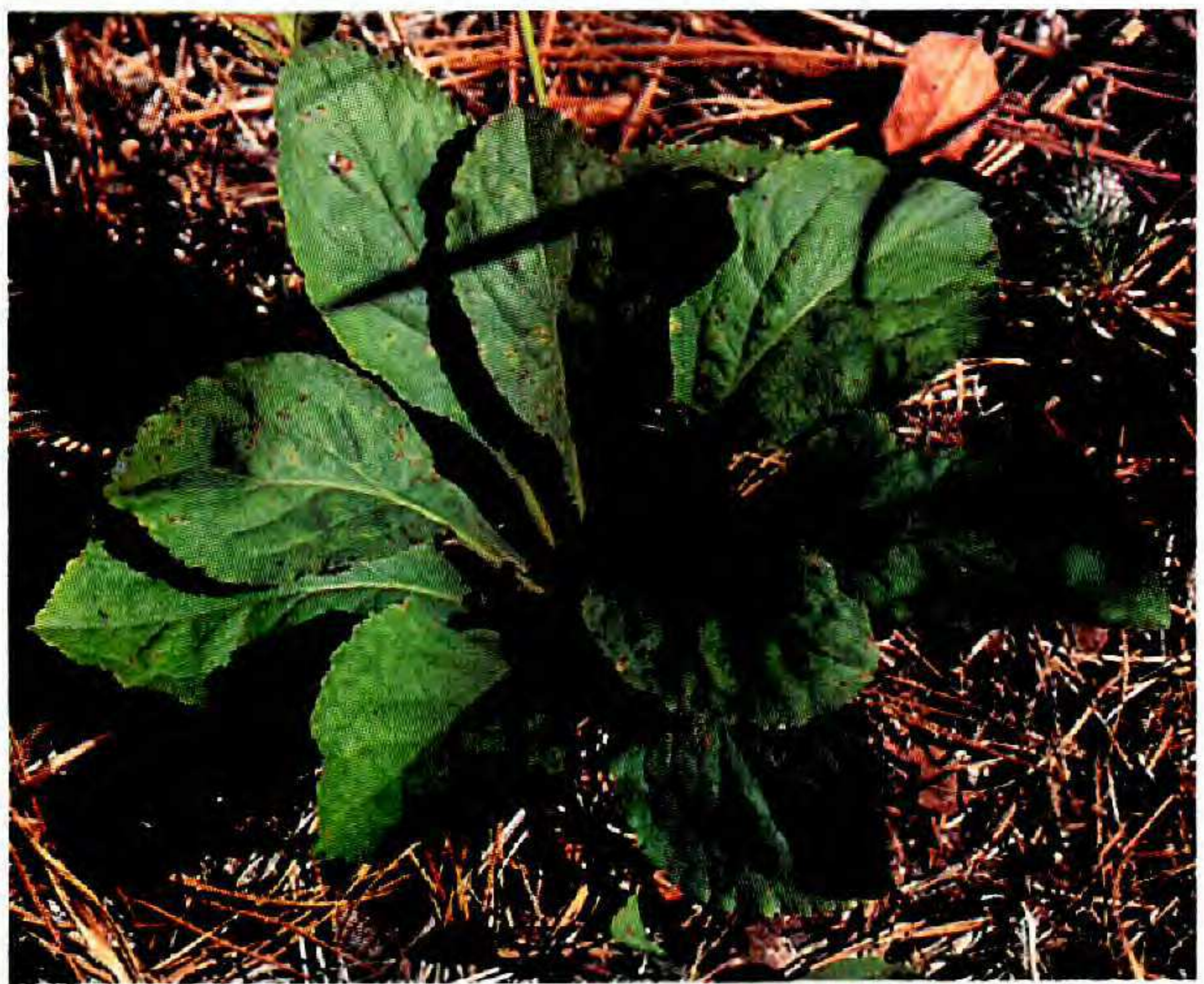
FIGS. 3–6. Solidago villosicarpa LeBlond. FIG. 3 (top left) simple elongate thyse inflorescence form. FIG. 4 (top right) example of the paniculately branched thyse. FIG. 5 (bottom left) close-up of the inflorescence. FIG. 6 (bottom right) a well-developed basal rosette.